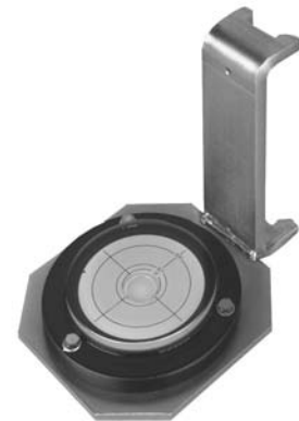
Flintec Bubble Level